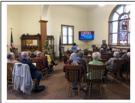
New audio/visual, blinds & carpeting