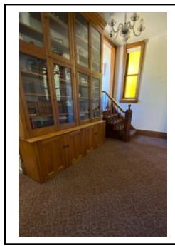
Carpeting and paint